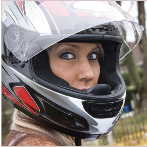
Premium Anti-Fog, Abrasion, Scratch and Mar Resistance

Visgard 200 (Pressure Sensitive Adhesive on Reverse) Visgard 275 (No Adhesive)