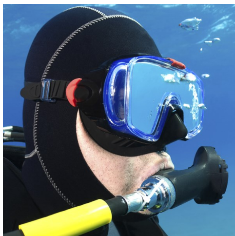
Premium, Permanent Anti-Fog Coating Cured on a Thin Polyester Base